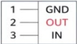
Adjustable Voltage Version