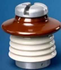
DIN T/F Insulator