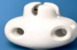
Egg / Stay Insulator