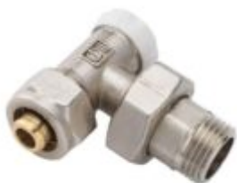
Robinet d'arrêt coudé 20 mâle IPA 20